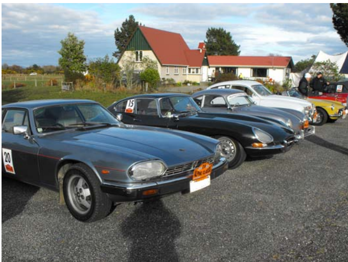
Lined up in Arahua on Saturday morning.