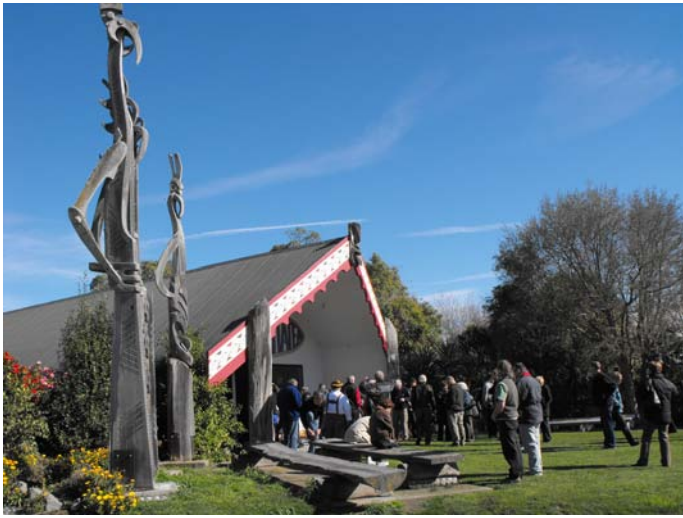
At the Kaikoura Marae.

The Alpine report is still to come but in the meantime we offer some high class literary endeavours and photos!