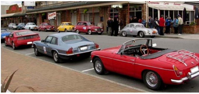
Some of the line up of cars in Kaikoura before the drivers' briefing.

Stretching before me as far as the eye could see, the road said "Fords, Fiats, Ferraris, Fiestas, come forth for all, for me, forthwith, forever." So I said to my car, "baby tonight, baby tonight, now you fire, all alone, you and I, forever in the blue Chev" But she said "it's been a hard days night and I've been working like a dog. It's been a hard days night, I should be sleeping like a log. But I will get up for you, it's just what I do and I'll feel alright."