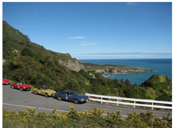
Beautiful weather on the West Coast for the Alpine.